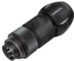
Male cable connector, cable outlet 7–17 mm