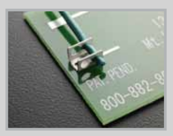
View of part after wire termination