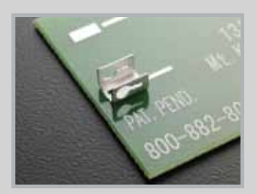
View of part before wire termination