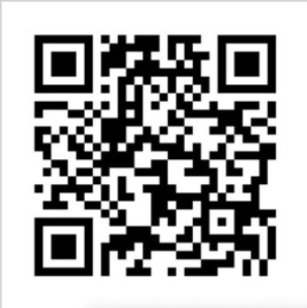
More Information Online